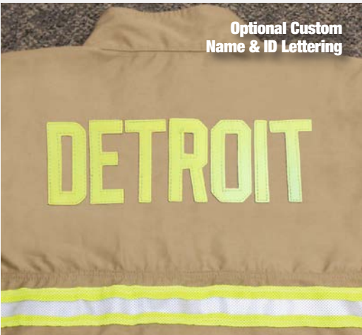
Optional Custom Name & ID Lettering