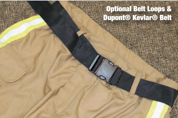
Optional Belt Loops & Dupont® Kevlar® Belt