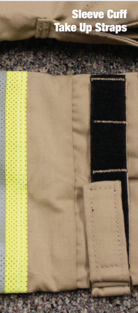
Sleeve Cuff Take Up Straps