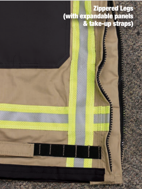
Zippered Legs (with expandable panels & take-up straps)