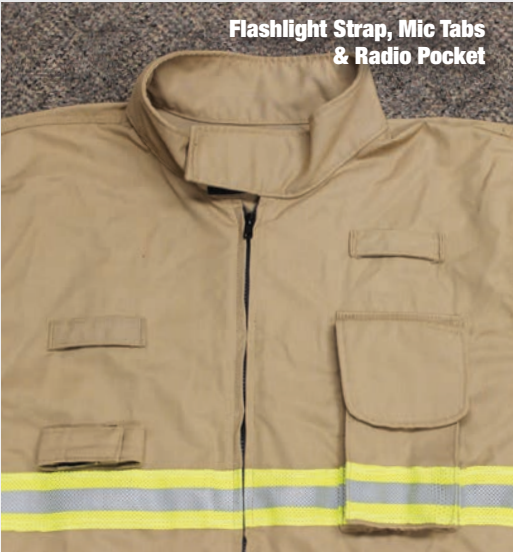
Flashlight Strap, Mic Tabs & Radio Pocket