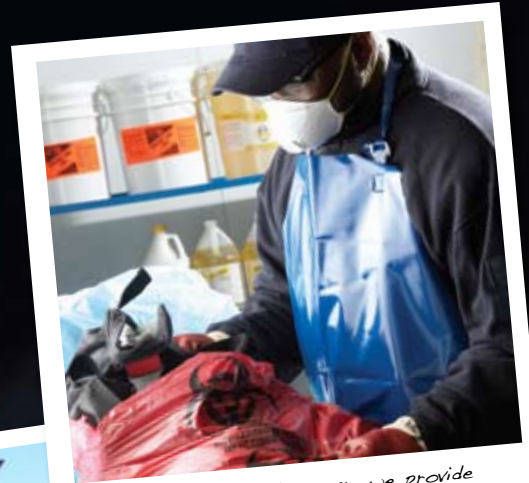
In addition to cleaning gear, we provide unparalleled decontamination and an exclusive disinfection process.