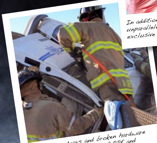
Rips, holes, tears and broken hardware diminish the protection of PPE and dramatically shorten its useful life.