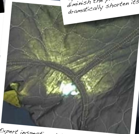
Expert inspection detects performance-threatening conditions. Early detection helps prevent ongoing degradation.