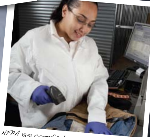
NFPA 1851 compliant recordkeeping tracks maintenance history of every PPE element.