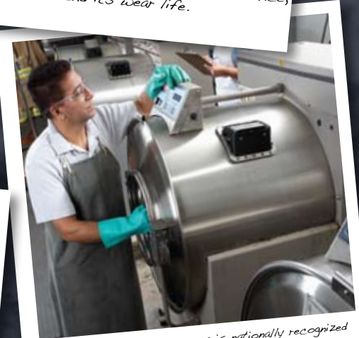
Our Ultimate Clean™ Process is nationally recognized as the best in the industry.