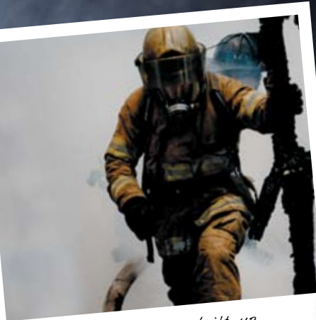
If not properly removed, built-up contaminants can destroy the advanced fabrics in your protective clothing and subject you to secondary exposure to carcinogens and toxins.