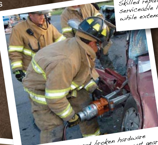
Rips, holes, tears and broken hardware diminishes the protection of turnout gear and dramatically shortens its useful life.