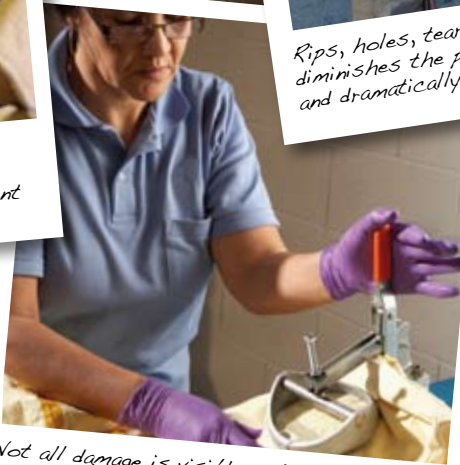
Not all damage is visible. We use a variety of test methods to evaluate the safety of your gear.