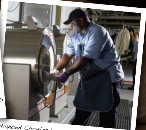
Advanced Cleaning removes built-up contaminants that destroy the advanced fabrics in your protective clothing and subject you to secondary exposure to carcinogens and toxins