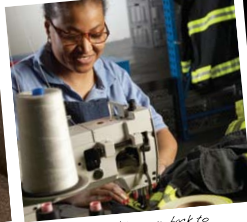
Skilled repair can bring gear back to serviceable levels of safety and performance, while extending its useful life