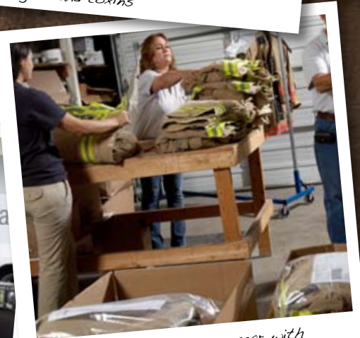
It's easy to maintain your gear with PASS. We provide prepaid shipping labels and free freight. We help you schedule your annual maintenance.